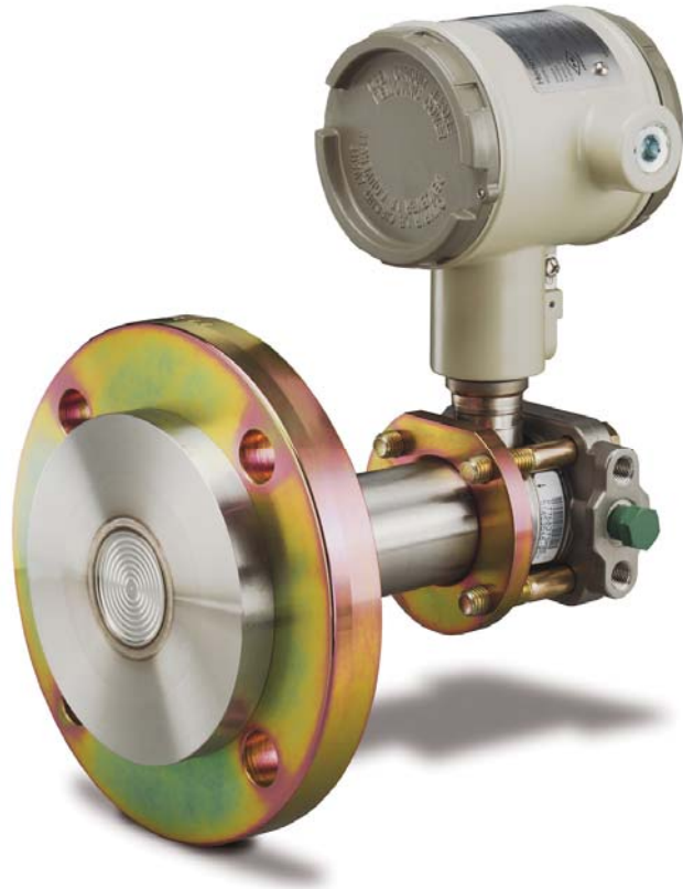
Figure 1 —Series 900 Flange Mounted Pressure Transmitters feature proven piezoresistive sensor technology.

The devices provide comprehensive self-diagnostics to help users maintain high uptime, meet regulatory requirements, and attain high quality standards. S900 transmitters allow smart performance at analog prices. Accurate, reliable and stable, Series 900 transmitters offer greater turndown ratio than conventional transmitters.