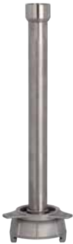
Storage tube SS1-Q2