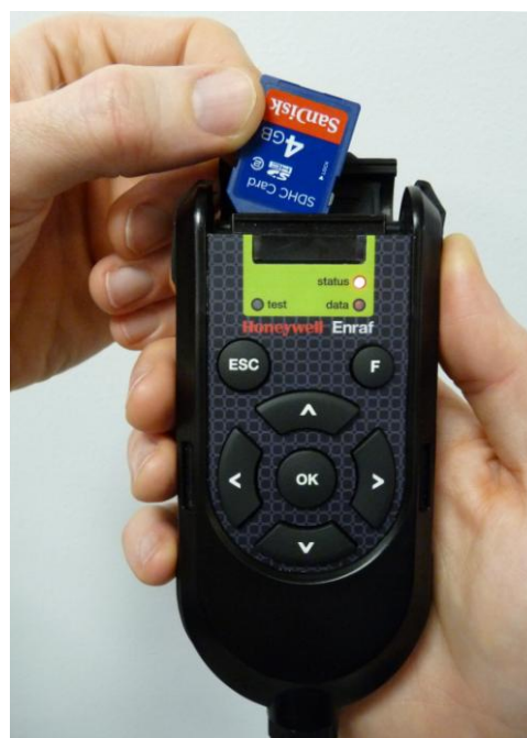
Fusion4 LAD (Local Access Device)

The LAD also enables rapid upload of configuration files for super fast set up, or download for copying to other devices or secure system back-up. Firmware upgrading to live devices in the field, uploading of language packs, assignable short cut key, and backlight for nighttime operation are just a few of the many other LAD features.