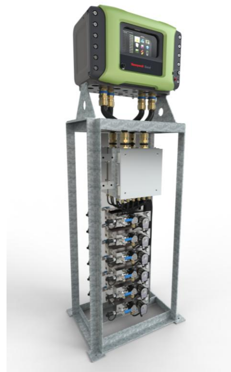
Fusion4 MultiPak Station